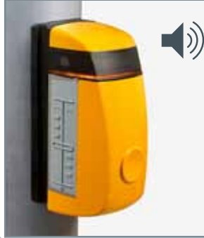
signalization of "green light" – message sappears and the appropriate ase signal sounds