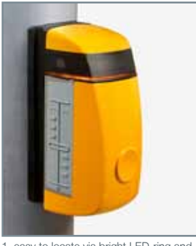
1. easy to locate via bright LED-ring and acoustic position signal